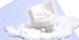
Polystyrene (#6) packing material (like computers and appliances come packed in). No peanuts, No LDPE (#4) Foam. It must be removed from the boxes.

NO Plastic Bags • Plastic Tops • Shredded Paper • Hard-Back Books • Scrap Metal • Tyvek® Envelopes • Plastic 6-Pack Holders • Needles or Syringes • Paper Ream Wrappers • Plastic Microwave Trays • Frozen Food Containers • Mirrors, Ceramics or Pyrex® • Light Bulbs, Plates or Vases • Drinking Glasses • Window Glass • Hazardous or Bio-Hazardous Waste • Plastics Other Than Those Listed • Tissues, Paper Towels, Napkins • Waxed Paper or Waxed Cardboard • Stickers or Sheets of Address Labels • Kraft® (orange/brown) envelopes • Styrofoam® Cups, Plates, Paper To-Go Food Containers