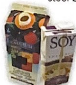
Paper milk/ juice cartons (no foil pouches, do not flatten)