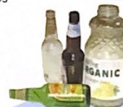
Glass bottles & jars