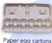
Paper egg cartons

No need to remove: paper clips, stamps, address labels, staples, tape, wire, metal fasteners, rubber bands, spiral bindings, plastic tabs.