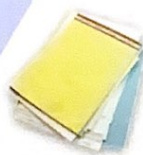
White or pastel office paper